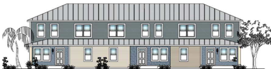
FRONT ELEVATION - MLK STREET - "ANTHONY" TOWNHOMES

This 7 acre site in Largo was purchased in October of 2021 and is currently in development to create 57-affordable townhome units. Development agreement was recently approved in March 2022 and we hope to break ground within the next 6 months. The concept is to have a mix of two to three-bedroom homes with a modern style with a total square footage of roughly 1,200 square feet. The overall project is estimated to cost $12 million, including the land acquisition.